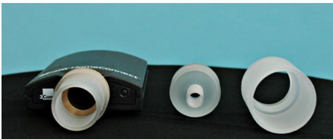
Standard stand-off tubes come in three sizes to enable measurement across smaller or larger corner radii.

CAPABILITIES: The GPA software provides a variety of data analysis tools for quick, accurate strain analysis. The user-friendly system provides a comprehensive graphical display of the major and minor strains with options to view thickness, effective or safety strains. Forming limit curves can be created and edited. Signature plots can also be displayed to help analyze the effects of a particular forming process. The GPA-100 is a completely portable system when used with a laptop computer. An external power supply is not required, as it runs directly from the computer. This truly portable configuration enables easy off-site measurement, measurement of large parts, and the ability to spot check parts from press lines.