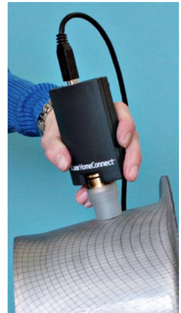
The GPA is a hand held system that uses a standard USB video camera with a close up lens and a specially designed lens assembly and viewing set.

The GPA is shipped with all necessary software, the camera, lens assembly, and documentation. A desktop or laptop computer and printer may be requested for an additional cost. Recommended computer: Pentium IV running Windows XP, with two available USB ports.